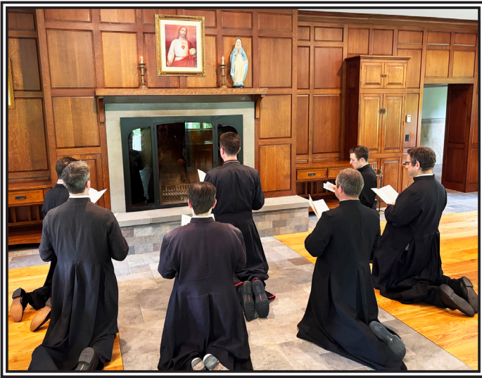
Renewing the Act of Consecration at the Seminary

Sacred Heart of Jesus. By entrusting the home to Him, a family opens the doors of the household to His grace and places itself under His loving protection. Of course, this does not mean that every difficulty will suddenly disappear. Families will still experience crosses: misunderstandings, illnesses, financial burdens, sufferings, and hardships. But after the enthronement, they face those trials with Christ reigning in their home, that is, with His grace sustaining them, guiding them, and strengthening them.