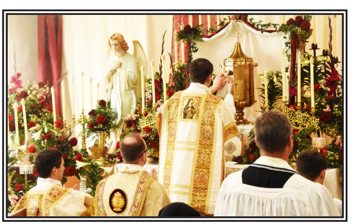
Placing the Holy Eucharist into the Urn