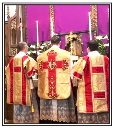
The Gloria of the First Mass of Easter