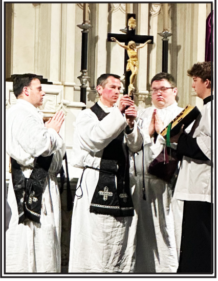
The Unveiling of the Cross