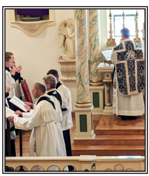
Chanting the Passion