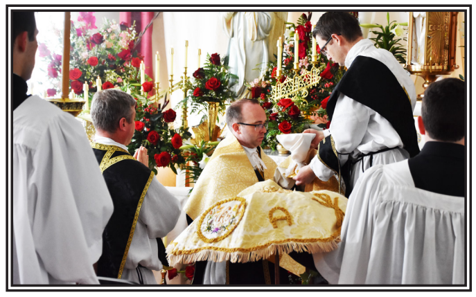
Returning from the Altar of Repose with the Blessed Sacrament