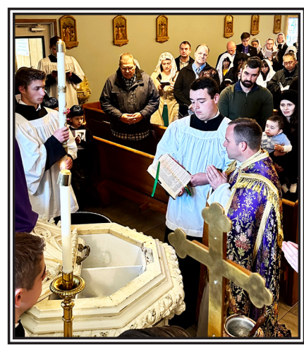
The Blessing of the Baptismal Font