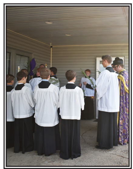
The Procession at the Church Doors