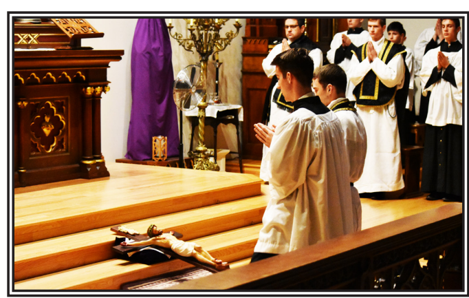
Adoration of the Cross