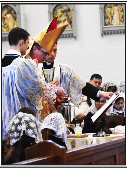
Consecration of the Holy Oils