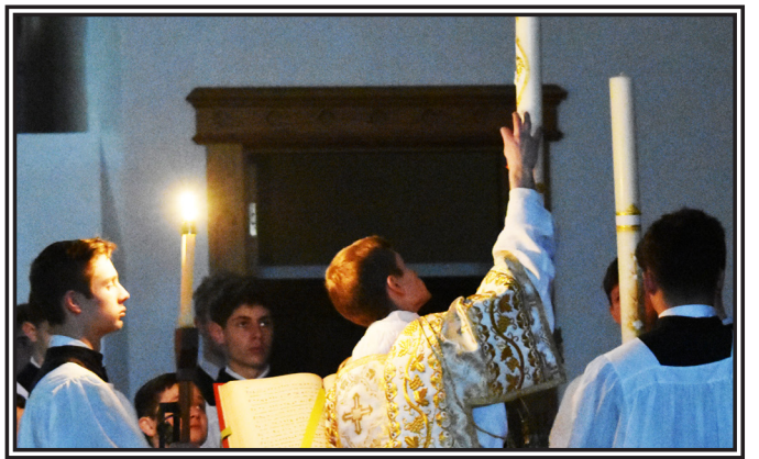
Placing the Nails and Incense Grains into the Paschal Candle