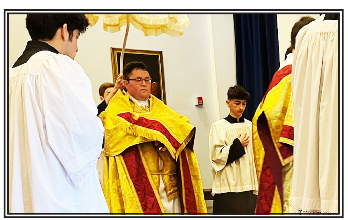
Procession to the Altar of Repose