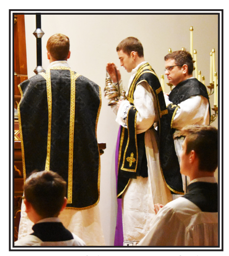
Mass of the Presanctified