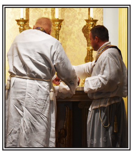
The Stripping of the Altar