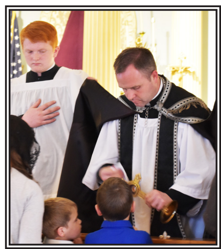
The Veneration of the Relic of the True Cross During Tre Ore