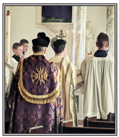
The New Fire, the Light of Christ, Enters the Church