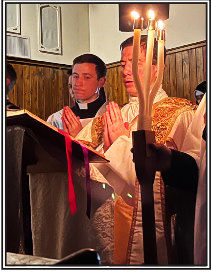
Chanting the "Exsultet," a Hymn in Praise of the Paschal Candle