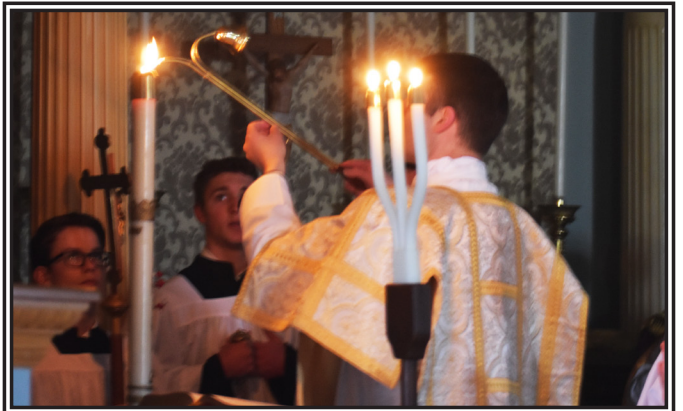
Lighting the Paschal Candle