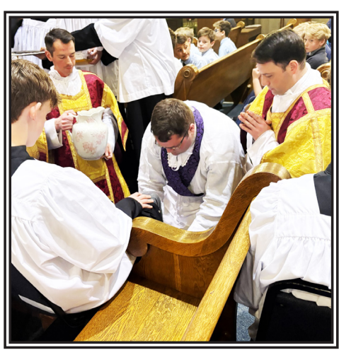
The Mandatum, or Washing of the Feet