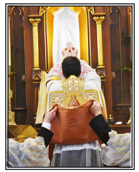
The Elevation of the Host