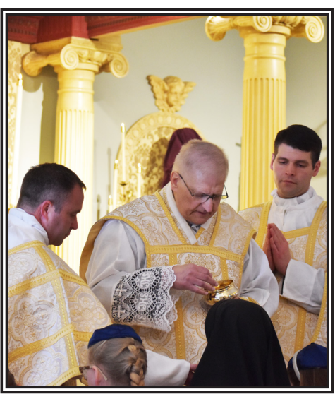
Administering Holy Communion