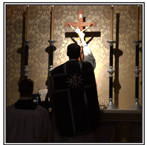
Elevation of the Sacred Host