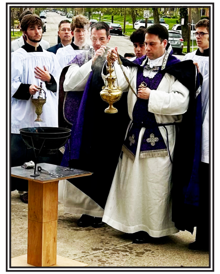
Blessing of the New Fire