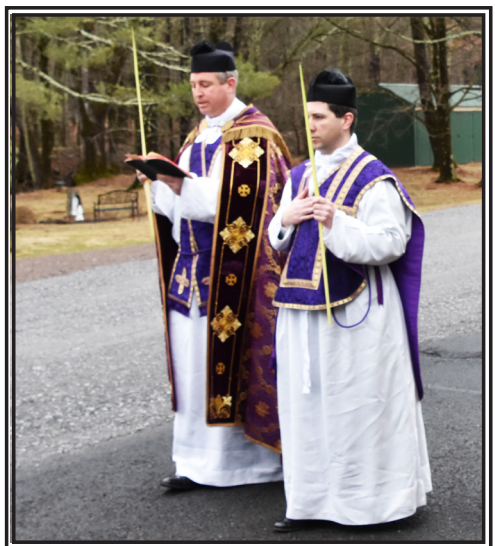
Palm Sunday Procession