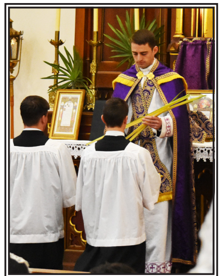
Distribution of Palms