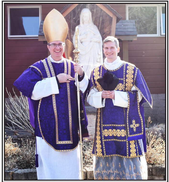
After the Ceremony