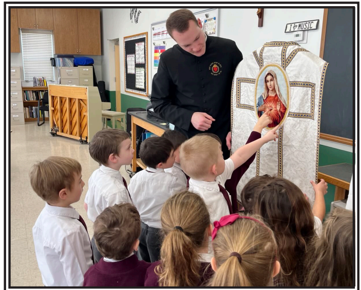
Showing the Children the Vestments Used for Mass