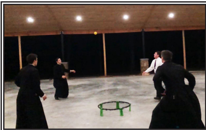
A Game of Spikeball at Recreation