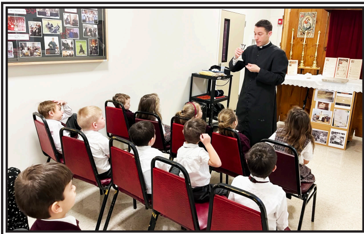
Teaching the Students About the Chalice