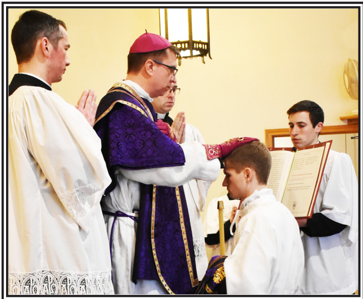
The Essential Matter for the Diaconate