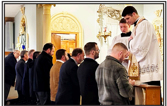
Enrollment into the Confraternity of St. Joseph