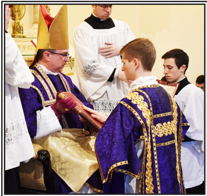
“Receive the power of reading the Gospel. . . .”