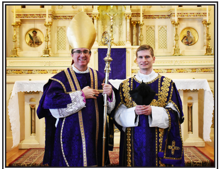
After the Ceremony