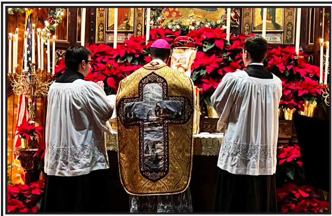
Gloria in Excelsis Deo