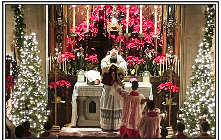
Midnight Mass at St. Pius V Chapel