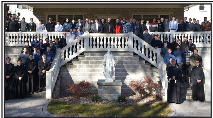
After the Boys' Retreat

Towards the end of October and into early November, we hosted three weekend retreats at the seminary: one for boys and two for men. The retreatants came from various parts of the country, as far as California, and numbered nearly one hundred and sixty. During retreat they had the opportunity to fortify themselves spiritually by their attendance at Mass, Holy Hour, and portions of the Divine Office, as well as by daily meditation, the Rosary, and spiritual reading. This year's series of conferences was centered around the Rosary: its importance in our lives and its place in the spiritual combat.