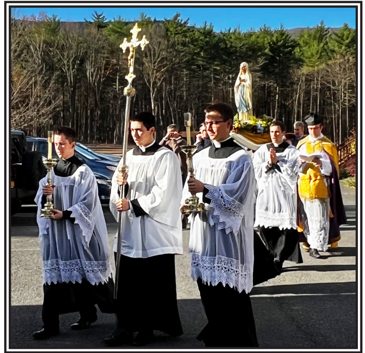
A Procession in Round Top for Our Country on the Feast of All Saints

Thanksgiving Day provides us with an opportunity to do this. On October 3, 1789, President George Washington signed a proclamation in which he instituted the first national Thanksgiving Day. In this proclamation President Washington declared that Thursday, November 26, 1789, be set aside “to the service of that great and glorious Being Who is the beneficent Author of all the good that was, that is, or that will be. This is to be a day of public thanksgiving and prayer to be observed by acknowledging with grateful hearts the many and signal favors of Almighty God.” Thus, when George Washington inaugurated the first Thanksgiving Day for the United States, he instituted it primarily to give thanks to God.