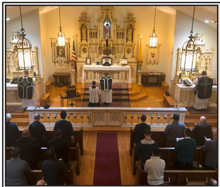
All Souls' Day Masses During Men's Retreat