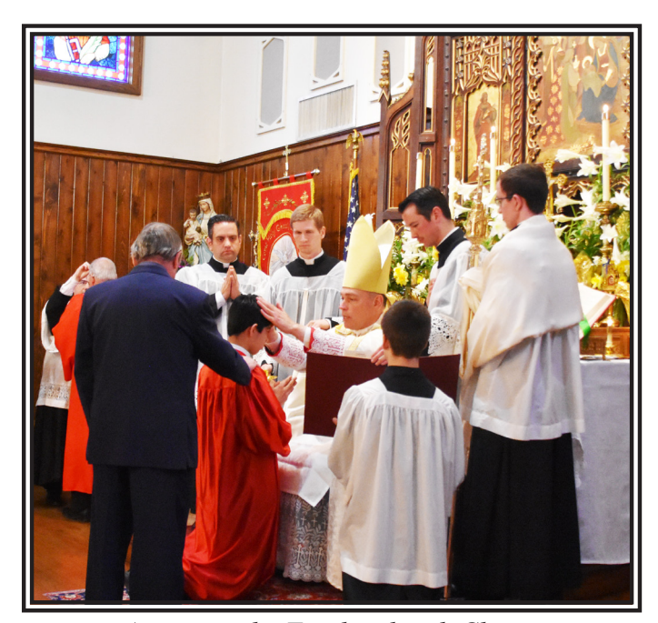
Anointing the Forehead with Chrism

Confirmation is a most important sacrament in this day and age. Baptism cleanses us from original sin, infuses sanctifying grace into our souls, makes us Christians, children of God, and heirs of Heaven. However, even after baptism the effects of original sin remain in our fallen human nature. We thus have a darkened understanding, a weakened will, and a strong inclination to evil, and we have to struggle against these effects daily. Besides this, the world and its allurements