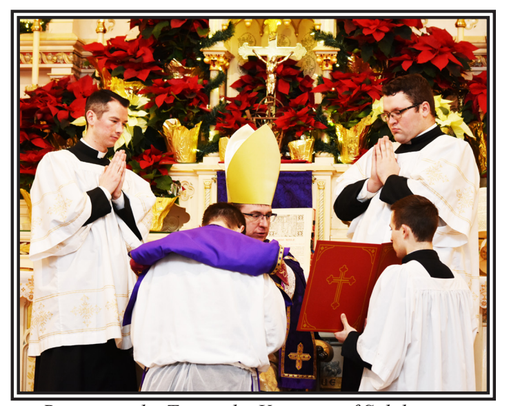
Receiving the Tunic, the Vestment of Subdeacons