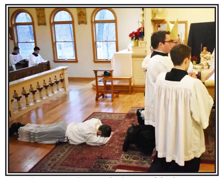
Prostration During the Litany of the Saints

The three major orders are subdeacon, deacon, and priest. Subdiaconate is the first degree of major orders.