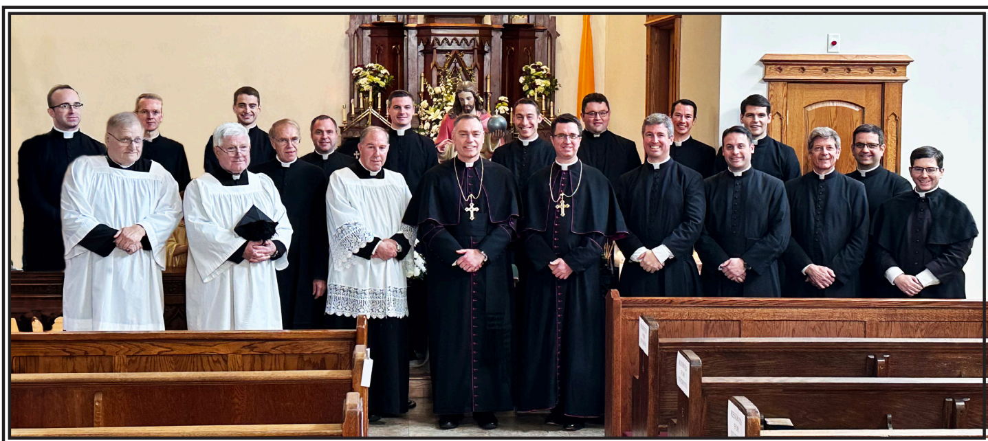
The Bishops and Priests of the Congregation and Society of St. Pius V Before the Solemn Pontifical Requiem Mass