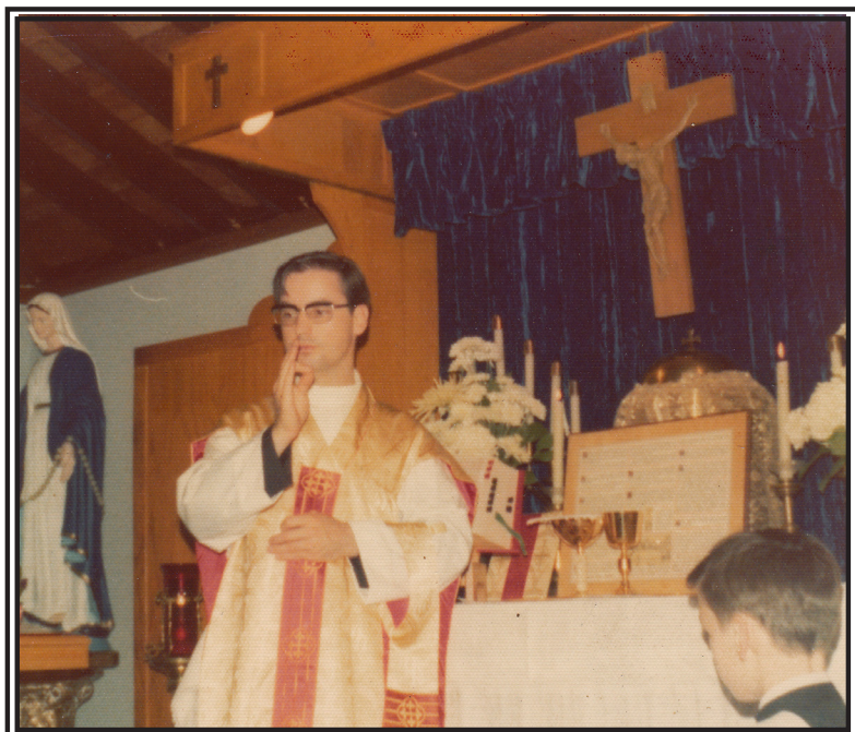
Offering Mass in the Early Years of His Priesthood